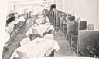
The Seeburg Remote Control Restaurant at Dallas, Texas, is a fine example of the Seeburg Remote Control Restaurant.