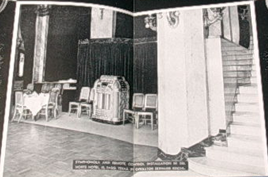
SYMPHONOLAS AND VOGUE CONTROL WITH AMPLIFIED BY THE HOTEL, IN THIS TOWN, IN QUARTER STREET, SEEBURG.