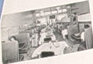
The Seeburg Remote Control Restaurant at Dallas, Texas, is a fine example of the Seeburg Remote Control Restaurant.

The Manufacturer thanks Seeburg's Southeast Distributor, Electronic-Salt Company, Inc., Dallas, Texas, for the information on these four pages. It clearly illustrates again, the tremendous