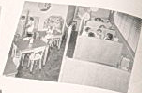
Seeburg Remote Control Restaurant at Dallas, Texas, is a fine example of the Seeburg Remote Control Restaurant.