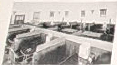
Seeburg Remote Control Restaurant at Dallas, Texas, is a fine example of the Seeburg Remote Control Restaurant.