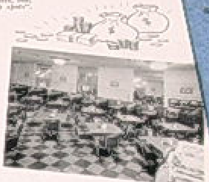
The Seeburg Remote Control Restaurant at Dallas, Texas, is a fine example of the Seeburg Remote Control Restaurant.