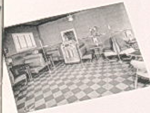
The Seeburg Remote Control Restaurant at Dallas, Texas, is a fine example of the Seeburg Remote Control Restaurant.