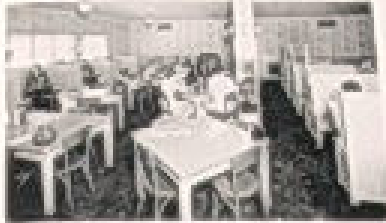
The Seeburg Remote Control Restaurant at Dallas, Texas, is a fine example of the Seeburg Remote Control Restaurant.

using power of Seeburg Remote Control, IT Electronics, Inc. New Seeburg equipment helps operators get the "Big Split".