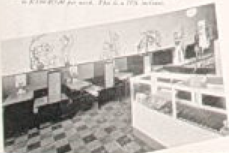
The Seeburg Remote Control Restaurant at Dallas, Texas, is a fine example of the Seeburg Remote Control Restaurant.